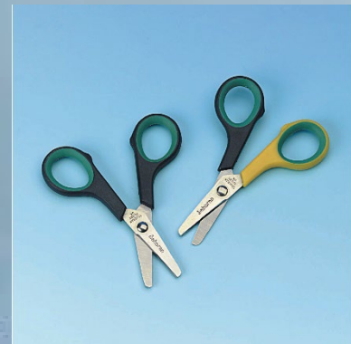
Example of specialist scissors available