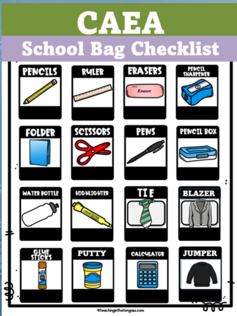
Example of scissors available in school

Students are welcome to bring in stationery from home and are encouraged to bring a pencil case which they can carry with them. If your child brings any stationery from home, please can you ensure that scissors are plastic and in line with those provided by the school. Please be assured that the school has scissors available for all students, as well as stationery resources for those who may need them. Specialist scissors are also available from the Occupational Therapist if students are struggling to use the ones available in class.